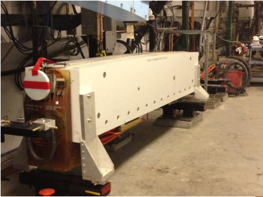
1R+ ZA magnet