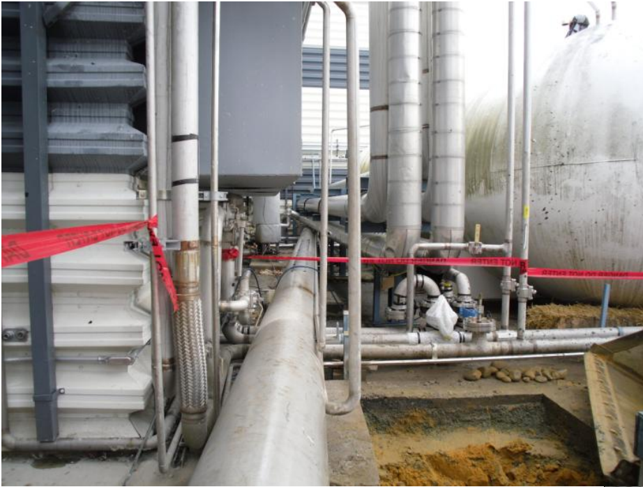
Recovery Compressor temporary cooling water hoses